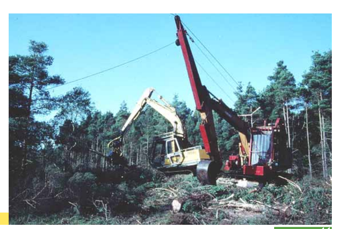
Felling work on Bettisfield Moss NNR