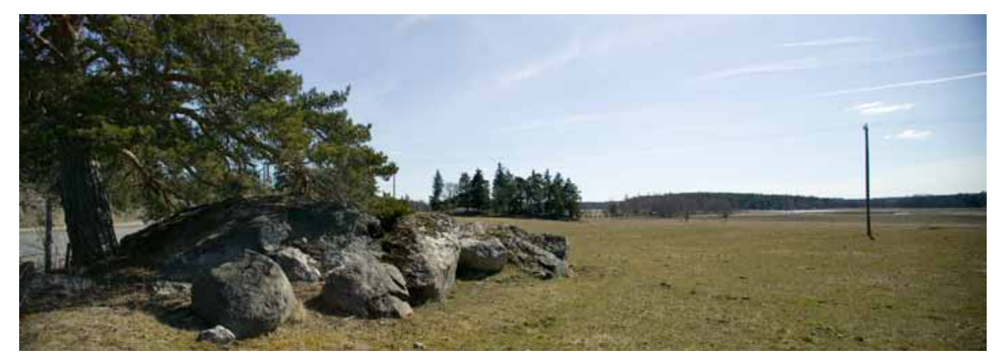
Rauvolanlahti, Finland (see case study 4.8)

and innovations. The case studies illustrate vividly that it takes time, skill, education, courage and creativity to build understanding and trust amongst stakeholders so that they can adhere to and support - through their activities - the main purpose of the nature directives as a new legislation for our common European heritage.