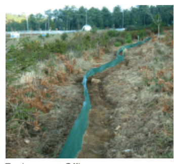
Environment Office, University of Vigo

In the Vigo University campus, near the Faculty of Philology and Translation, every year hundreds of common toads of the subspecies Bufo bufo spinosus turn up at the nearby lake. During February and March, a time which coincides with the migration of reproducing adult toads, a massive number of individuals were found run over on the campus ring road. In 2002, at least 634 were found dead in this manner.