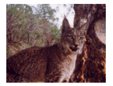
Ministerio de Medio Ambiente

programmes which favour lynx favourite prey (the rabbit) the bringing in of live prey to enclosures, the installation of structures which can be used as dens, drinking troughs, etc. Alongside these activities for conserving the species in its own habitat is a captive breeding project in the Acebuche Breeding Centre. Last year, the first cubs were born here and this year the successful event was repeated.