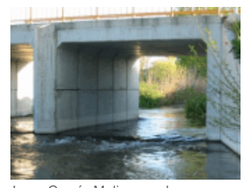
Andrés Martínez de Azagra

It is becoming more and more frequent to find in our communication networks tubes, or pontoons with tubes used to cross watercourses. However, according experience gathered from other countries, these transversal drainage structures can generate serious environmental problems in watercourses with fish populations, by impeding or Jorge García Molinos and limiting their natural movement.