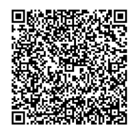
Self-guided brochure (spanish) - Cañada Real Segoviana-Los Alcornoques trail