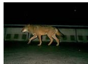
CEDEX (Ministerio de Fomento)/Universidad

The Departamento de Ecología of the Universidad Autónoma de Madrid undertook a study project during 2000 and 2002, which was funded by the DGCEA of the Ministerio de Medio Ambiente through CEDE. The aim of the project was to monitor the effectiveness of the measures of highway permeability on lineal infrastructures for wildlife. The study was based on the Rías Baixas (A-52) and Camino de Santiago (A-231) highways.